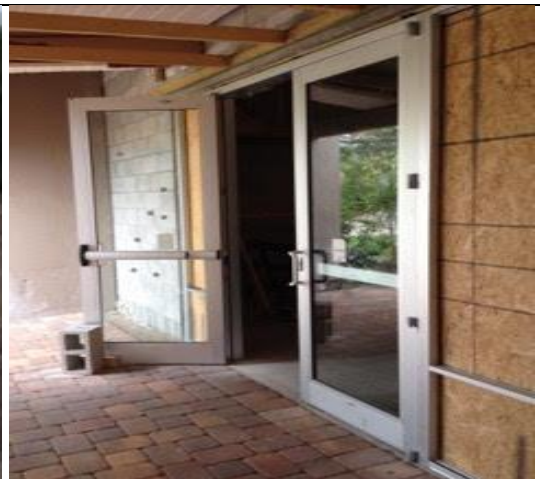
Upper Left- grading of parking lot Upper Right- Storefront door frames and doors installed Lower Left- Interior wall frames installed Lower Right- closet framework and ductwork framework