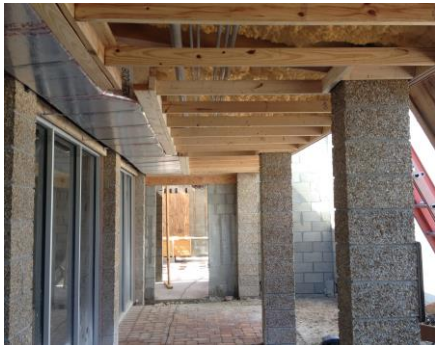
Ductwork moved outside, new ceiling in walkways will be flat