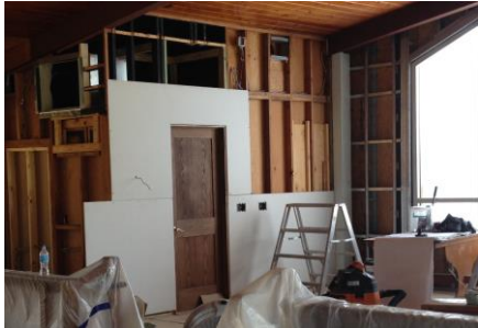
First sheets of sheetrock up in the church! This door goes to the vesting sacristy