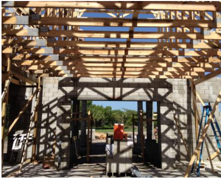
Roof trusses over narthex