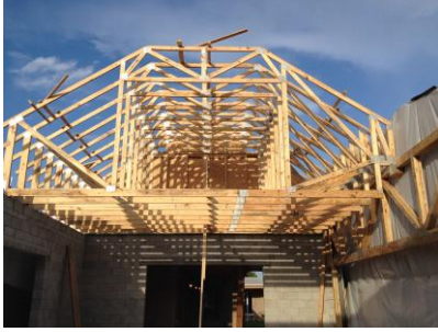
Trusses over narthex