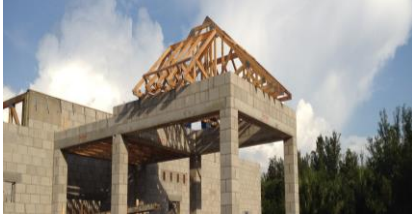
new west entry