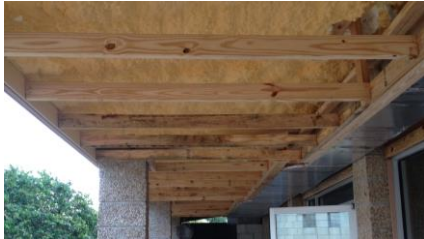
Supports for ceiling in walkways